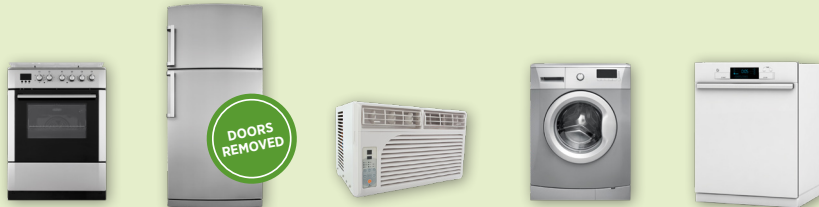
Stoves • Refrigerators • Freezers • A/C Units • Washers • Dryers • Dishwashers