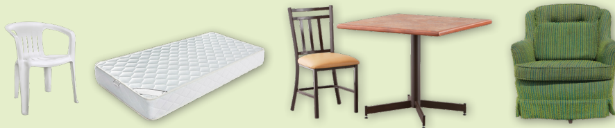
Patio Furniture • Box Springs & Mattresses • Dining Tables & Chairs • Chairs & Sofas